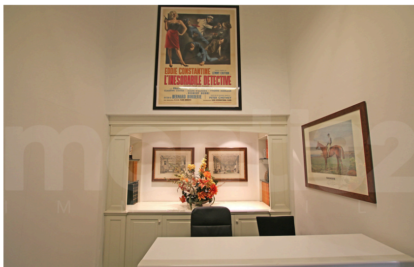
Corso Magenta – MM Cadorna.

Bright 55 sqm office, located in a prestigious early 20th-century building with half-day concierge service. Nestled in one of the most sought-after and well-connected areas of the city, this space offers a quiet internal exposure, ideal for working in peace. The office consists of an entrance with reception, a main work area with an additional mezzanine room, a hallway/kitchenette, and a bathroom. In good condition and furnished, this versatile environment can be easily customized to meet your professional needs. Equipped with independent heating that ensures maximum comfort in every season. Security is provided by a reinforced door, offering peace of mind and protection. Price € 1,700.00 per month + condo fees. Energy rating G – 175 kWh/sqmy.