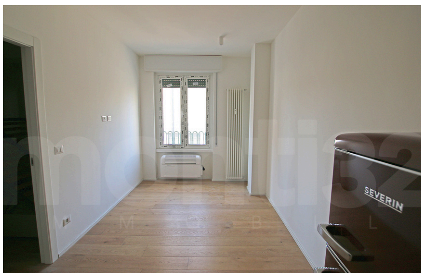
Via Losanna – MM Cenisio

Bright 50 sqm two-room apartment located on the first floor of a 1950s building, with a lift and concierge service available all day. This apartment, with an external exposure, consists of a living room with an open kitchen, a double bedroom and a modern bathroom. Completely renovated and furnished, this apartment is ready to be inhabited. Among the features, central heating, air conditioning for maximum comfort and a security door that offers security. Price € 1,300 per month + condo fees. Energy rating E - 175 kWh/sqmy