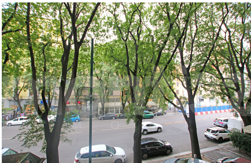
Via Buonarroti – MM Wagner.

In a 1950s building with front desk service half-day and elevator, a bright 42.50 sqm apartment with external exposure, comprising an entrance hall, living area with open-plan kitchen, a master bedroom, and a windowed bathroom. The property is in very good internal condition and is rented unfurnished (as shown in photos). Central heating, vintage Marmette floors. Price € 950.00 per month + condo fees. Energy rating G – 175 kWh/m²a. For information: tel. 024984412 Monti32 Immobili www.monti32.it