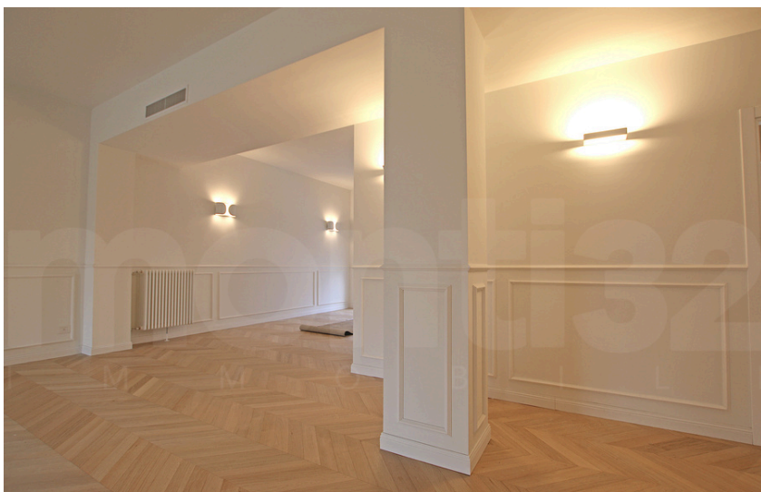
Via Alberto da Giussano – Pagano

Located in a prestigious period building, renovated in the common areas, with concierge service and elevator, in the heart of one of Milan's most exclusive and sought-after residential areas, we offer for sale a refined and bright 180 sqm residence, enhanced by a spacious 60 sqm terrace overlooking the greenery of a quiet internal garden. A spacious entrance opens onto an elegant double living room with dining area and open-plan kitchen, ideal for both entertaining and everyday living. The sleeping area comprises three generous bedrooms, a walk-in wardrobe, as well as an additional staff room/home office. The layout is completed by three well-distributed bathrooms, ensuring maximum comfort, along with a convenient laundry room. The apartment has been fully renovated to the highest standards, never occupied, and boasts high-end finishes and 3.20-meter-high ceilings, creating a bright and airy atmosphere. Central heating and ducted air conditioning throughout. Flooring is in premium herringbone parquet, with marble bathrooms. The property also includes two cellars, with the possibility to purchase a garage within the building. Price € 2,900,000. Energy rating C – 175