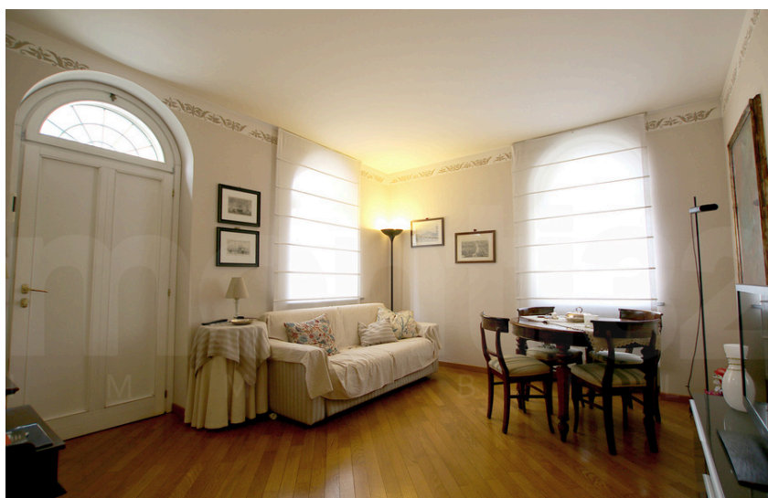
Via Marghera – MM Wagner.

An ideal area for those seeking comfort, quality of life, and a strategic location. In an elegant 1930s “Old Milan” period building with elevator, we offer for rent a charming and bright 65 sqm one-bedroom apartment, located on a high floor and overlooking the inner courtyard, ensuring peace and privacy. The property features an entrance from a private balcony walkway (no through passage). The apartment comprises a cozy living room, semi-separate kitchen, spacious double bedroom, hallway with practical built-in wardrobes, and a windowed bathroom. It is in excellent internal condition and comes fully furnished. Amenities include independent heating with radiators, air conditioning, and parquet flooring. Monthly rent: € 1,600 + condominium fees.