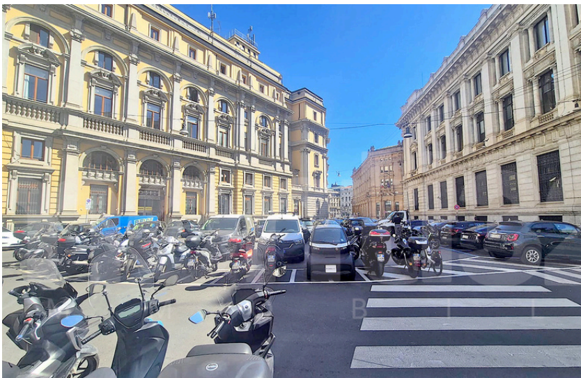
Via del Bollo – Cordusio

In the heart of Cordusio, Via del Bollo, we are pleased to offer for rent a prestigious and bright 242 sqm loft, registered as residential property category A/2, set within a 17th-century historical building. The property has been completely renovated to the highest standards and tastefully furnished with refined designer interiors, while preserving its original historic charm through magnificent vaulted ceilings, decorative capitals, and exposed wooden beams. Arranged over multiple levels, the apartment features an entrance hall, two spacious living rooms, a dining room, a fully fitted eat-in kitchen, three bedrooms, three bathrooms, a laundry room, and a walk-in wardrobe. Additional features include independent heating, air conditioning, alarm system, security door, and a small private courtyard area. Garage parking available upon request.