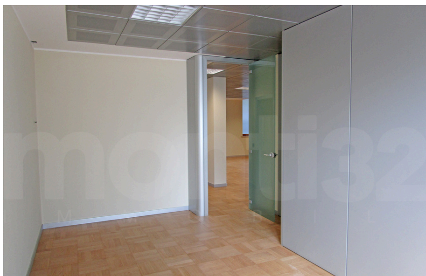
Viale Cassiodoro – CityLife

Located in an elegant 1970s residential building with full-day concierge service, this bright and modern office of approximately 160 sq m benefits from dual exposure and an excellent layout. The property comprises an entrance opening onto a spacious open-plan area, three independent offices, and two separate restrooms for men and women. It is presented in excellent condition and is available unfurnished. Features include central heating, air conditioning, a security door, and an alarm system. The parquet flooring enhances the premises with an elegant and professional appearance. Price €3,600 per month + condo fees. Energy rating D – 240.73 kWh/sqm per year.